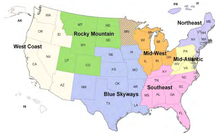
Regional Clean Diesel Collaboratives