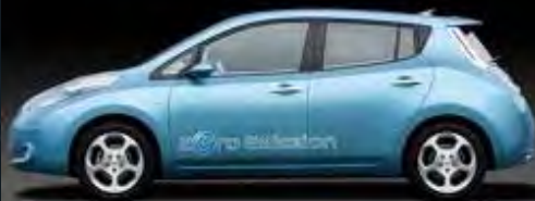
Electric car (Nissan Leaf)