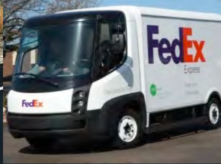
Medium-duty battery truck