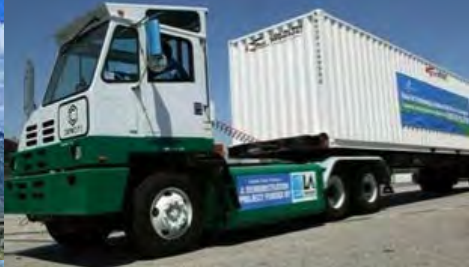
Heavy-duty battery truck