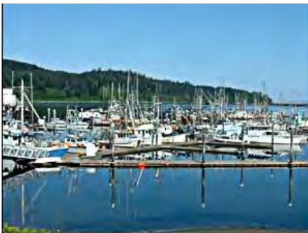
Nine upgraded fishing vessels