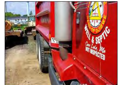
Dump truck with diesel oxidation catalyst